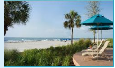
Marriott Oceanfront at Palmetto Dunes

The following tidbits are your VIEW THROUGH THE KEYHOLE for Hilton Head 2009.