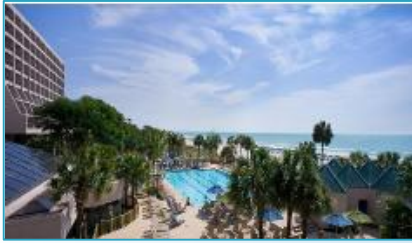
Marriott Oceanfront at Palmetto Dunes